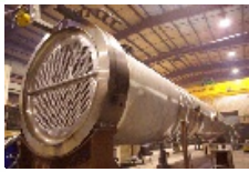
Heat exchanger & Pressure Vessel detailing